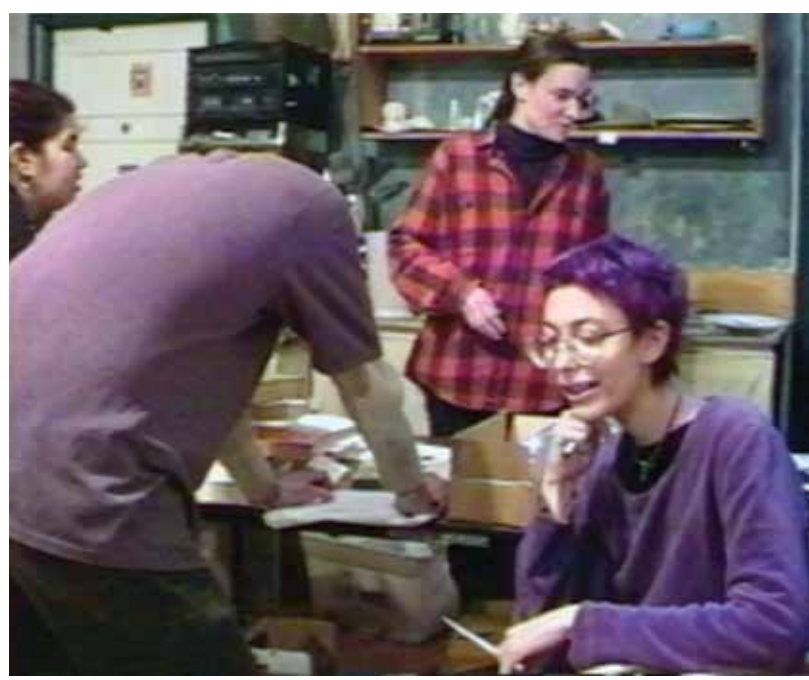
Books Through Bars 1997

A Cop Watcher's Story: El Grito de Sunset Park Attempts to Deter Police Brutality (Steve de Sève, Brooklyn Information and Culture TV [BRIC TV], Copwatch Brooklyn, 2017, 6 minutes)