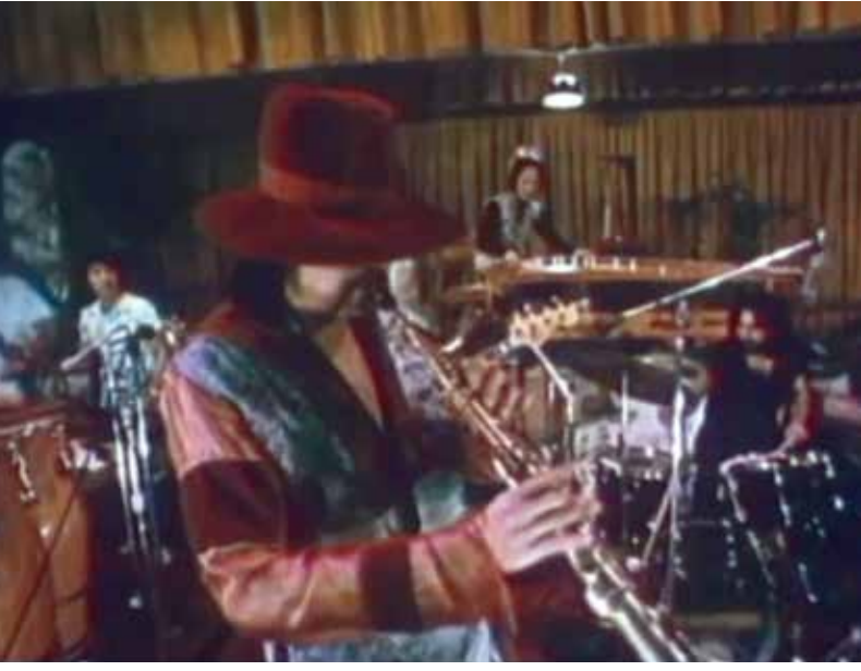
Cruisin' J-Town 1974

Diabetes: Notes from Indian Country (Beverly Singer, 2000, 23 minutes) B