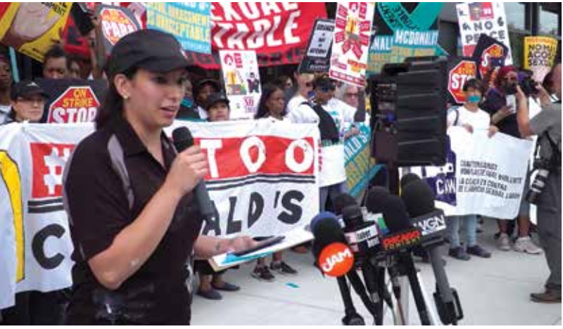
I'm NOT on the Menu 2018