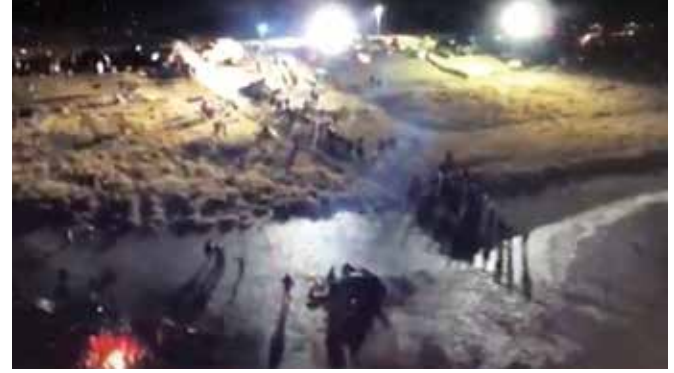
Digital Smoke Signals: Aerial Footage from the Night of November 20, 2016 at Standing Rock 2016