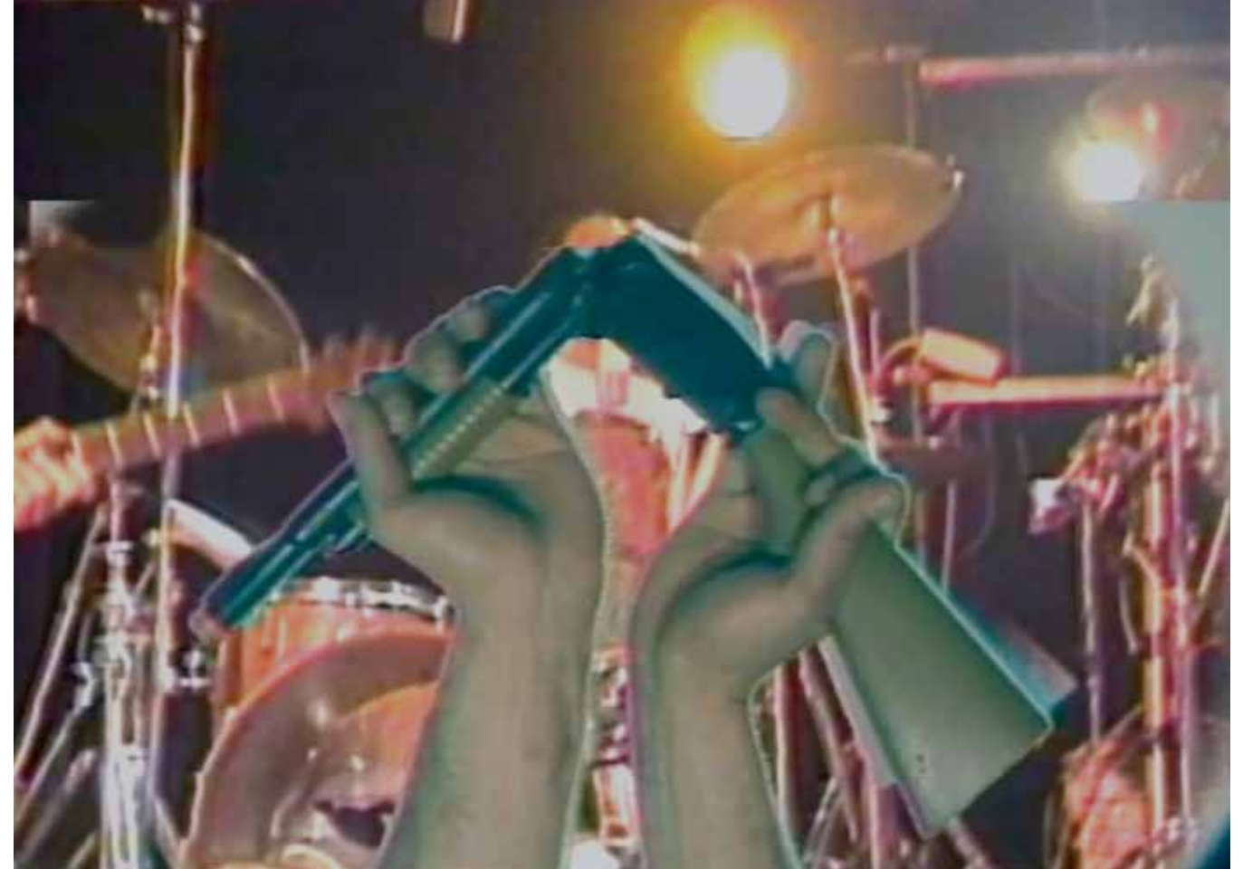
Just Say No: The Gulf Crisis TV Project #55 1990

STATES OF VIOLENCE (1978-2017), Various Directors