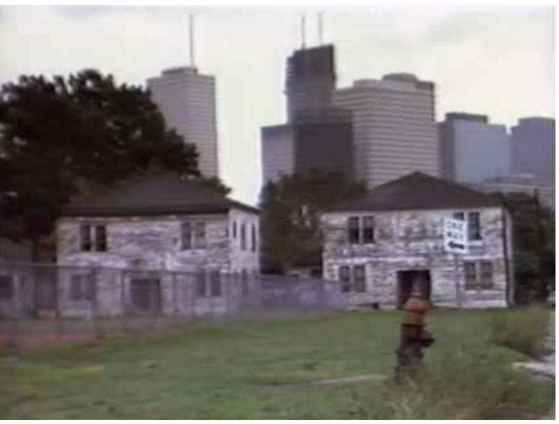
The Invisible City: Houston's Housing Crisis; Part 2: Messages 1979

The Invisible City: Houston's Housing Crisis; Part 2: Messages (James Blue with Adèle Naudé Santos, South West Alternative Media Project, 1979, 28 minutes) A